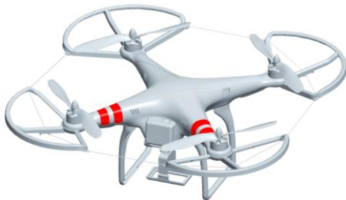
Fig.2 Installation is OK/图2 正确安装示意图